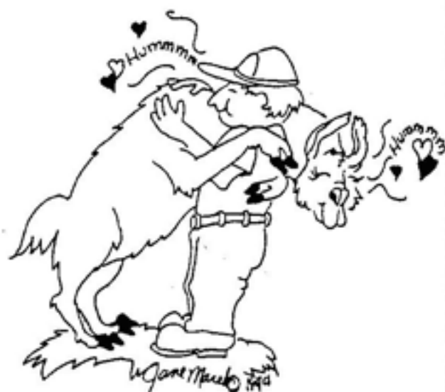
Bonding with your llama

Why should we try to improve communication with our llamas? Communication is a process by which information is exchanged between individuals through a common system of symbols, signs, or behavior. Communication with our llamas can greatly enrich our life with them, even if our daily encounters are limited to feeding and routine chores. Through observation, trust, patience and time, we can get to know each of our llamas as distinctly different individuals. Through communication, we can convey our wants, needs, and desires to them to reach predetermined goals, whether the goal be to train a llama to pull a cart, or simply to allow us to pick up its back foot. Through further observation and communication we can also pick up on the llama's wants and needs and their attempts to convey them to us.